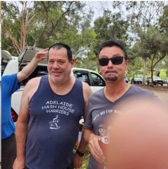
Does anyone recognise these two youngsters?